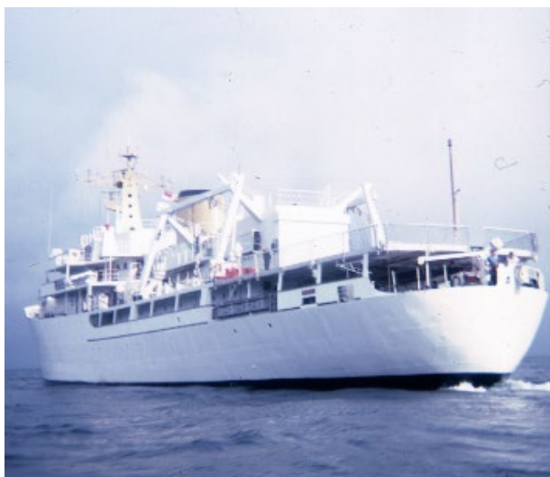
Above and below: HMS Herald