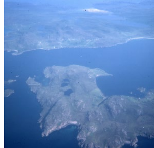
Above: Summer Isles (Tanera Mhor) Below: Flight from Inverness to Stornoway