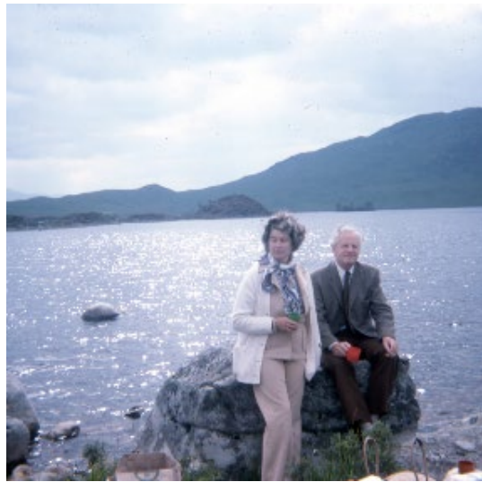
Below: Mother and Father beside a Scottish loch