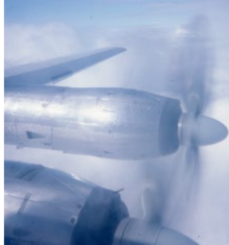
Below: near Ben Nevis