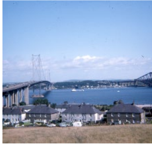
Above: Forth Road and Railway Bridges