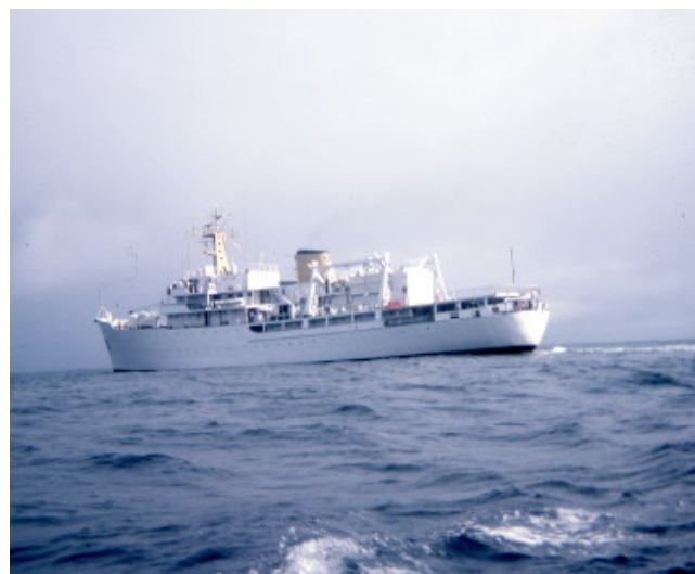
Above and below: Leaving HMS Herald