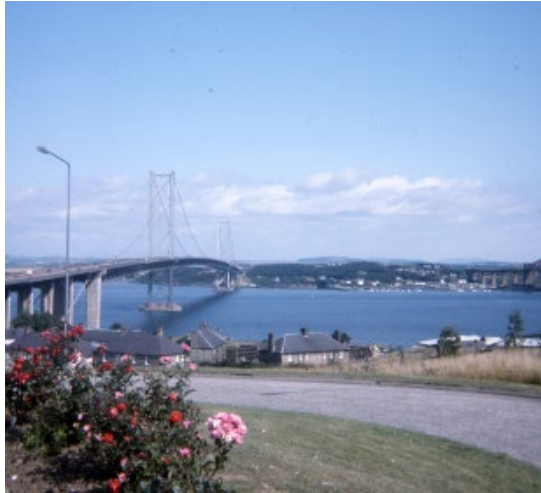
Above: Forth Road Bridge